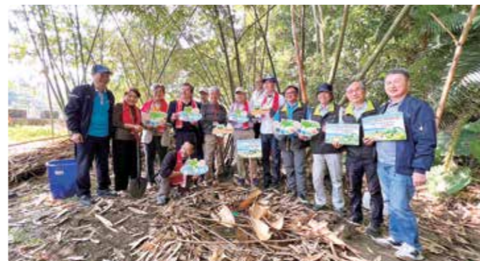
D3470 Through a GG project, RC Touliu North of D3470 and RC Kyoto Rakuto of D2650 work together to conduct on-site inspections in the Hushan Reservoir community.