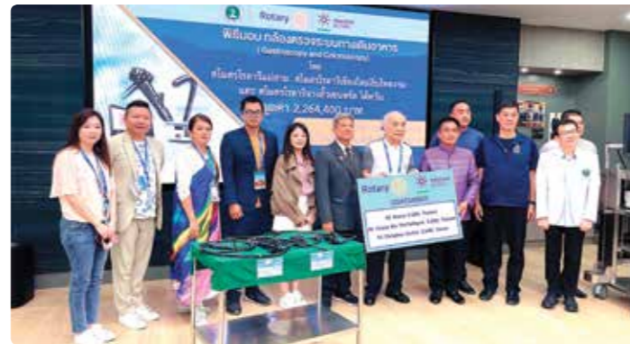
D3462 Together with the Rotary clubs of D3360, RC Changhua Central provides gastrointestinal endoscopy equipment at Mae Sai Hospital in Thailand.