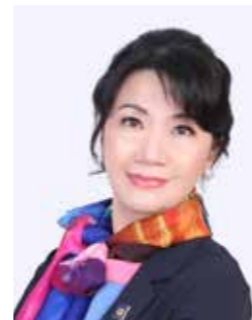
黃桂香 Huang, Kuei-Hsiang (Jennifer) District Governor 2023-24

98 Clubs 3,138 Members as of 15 April 2024 Total Contributions: $1,186,752.72 as of 12 April 2024