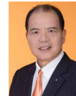
章金元 Chang, Ching-Yuan (Michael) District Governor 2023-24

67 Clubs 2,494 Members as of 15 April 2024 Total Contributions: $461,508.34 as of 12 April 2024