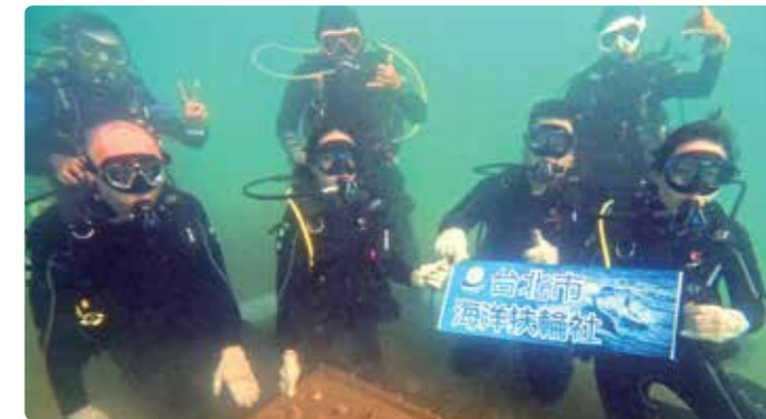
D3522 Rotarians of RC Taipei Great Pacific and volunteers dive in the ocean for a coral reef restoration project in Penghu and promote sustainable environmental protection.