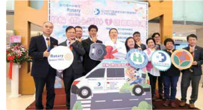
D3501 Through jointly sponsoring GG2348772, RC Hsinchu Downtown, RC Hsinchu North, RC Miaoli, and RC Wonju in South Korea donate a Mobile Health Vehicle to Miaoli Da Chien Health Medical System for serving in remote Tai'an Township.