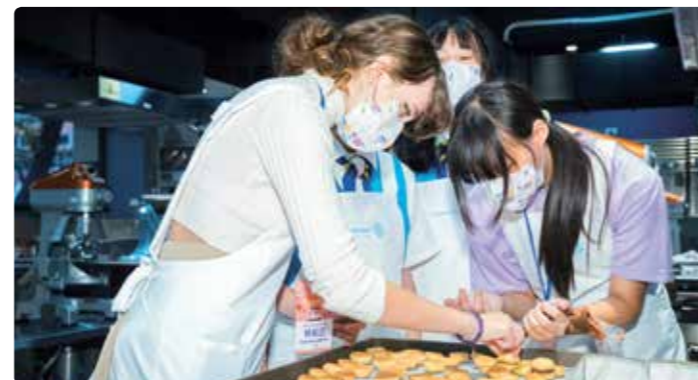
D3490 The participants of RYLA camp at LeeMing Institute of Technology sponsored by the Interact committee of District 3490 learn a lot with special experiences.