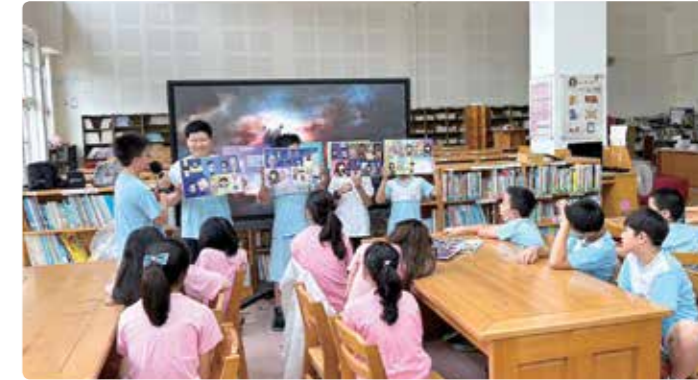
D3521 RC Taipei Choumei sponsors a campaign at Taipei Municipal Yi-Fang Elementary School to ensure young students to learn how to prevent from the drug abuse.