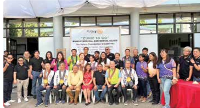
D3461 Rotarians of RC Tachia Central participate in a donation ceremony for the Global Grant (GG) project #2349944 Accessible Mobile Clinic for Remote Barangays, which is co-sponsored by the Rotary clubs in Taiwan and RC Midtown Tarlac of D3790 in the Philippines.