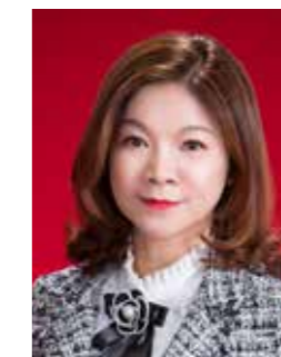
楊奕蘭 Yi-Lan, Yang (Stela) District Governor 2023-24

80 Clubs 2,582 Members as of 15 April 2024 Total Contributions: $2,137,268.78 as of 12 April 2024