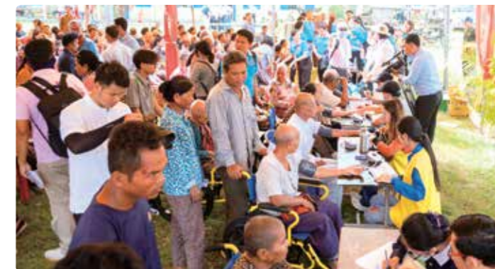
D3523 168 Rotarian doctors and volunteers in D3523 travel to rural areas in Cambodia, providing free medical services and donating medical equipment for the need.