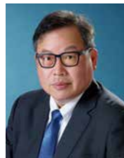
莊子華 Robert T.H. Chuang (Coach) District Governor 2023-24

84 Clubs 2,706 Members as of 15 April 2024 Total Contributions: $868,819 as of 12 April 2024