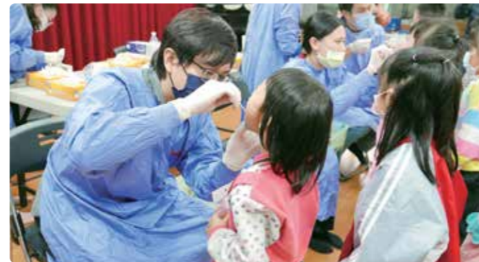
D3482 RC Taipei Yinlog is joined by other four Rotary Clubs in D3482, and RC Suao in D3490, and its service partners Taipei City's Seda Charity Love Association and Yuan Heng Dental Clinic, and they co-host a service event of the oral health care for the kids in Masai Elementary School.