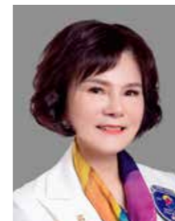
林淑華 Lin, Shu-Hua (Joyce) District Governor 2023-24

78 Clubs 2,890 Members as of 15 April 2024 Total Contributions: $1,754,482.23 as of 12 April 2024