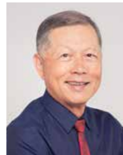
楊金振 Yang, Chin-Cheng (Tony) District Governor 2023-24

69 Clubs 3,107 Members as of 15 April 2024 Total Contributions: $812,177.5 as of 12 April 2024