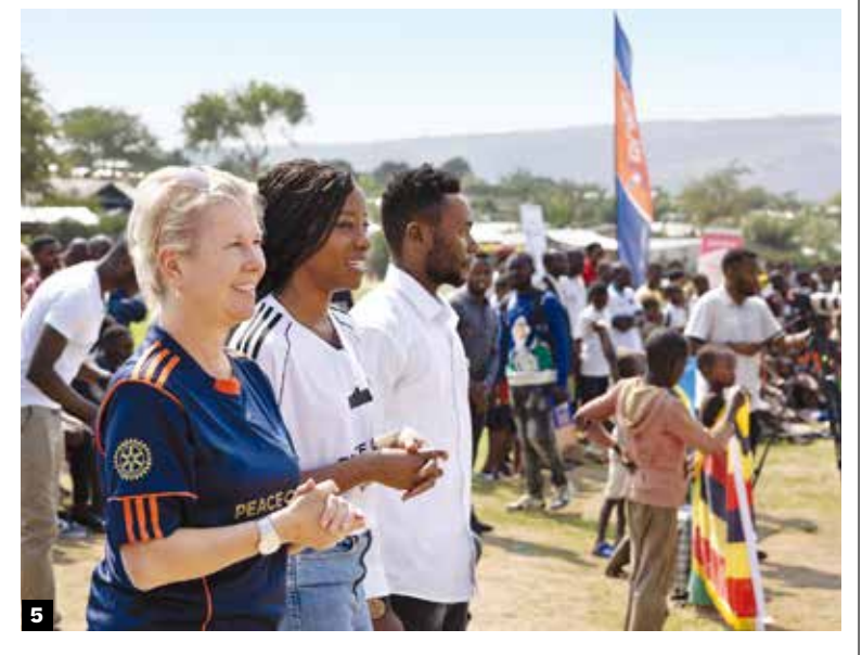
1. 在 9 月於紐約市舉辦的全球公民節活動中,國際扶輸社長珍妮佛・瓊斯宣布扶輸承諾將再投入 1 億 5,000 萬美元給全球根除小兒麻痺計畫。2. 去年 8 月造訪尚比亞時,瓊斯與扶輪第一筆大規模計畫獎助金得主「無瘧疾尚比亞夥伴」計畫的衛生工作人員交談。3. 瓊斯與她在參觀瓜地馬拉識字計畫時認識的學生喬哈娜・席夢 (Johana Mishel Chutá Simón) 背靠背站立。4. 去年 7 月,在她想像扶輪加拿大之旅的某一站,瓊斯擁抱穿著加拿大皇家騎警紅色上衣的棕熊玩偶。5. 去年 9 月,在烏干達納基維爾 (Nakivale) 難民營的一場足球賽中,瓊斯和演員思邦吉樂・姆蘭伯 (Sibongile Mlambo) (中) 一起共享歡樂。